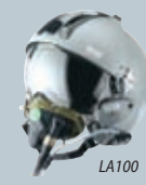
Helmets for Jet-Fighters Pilots