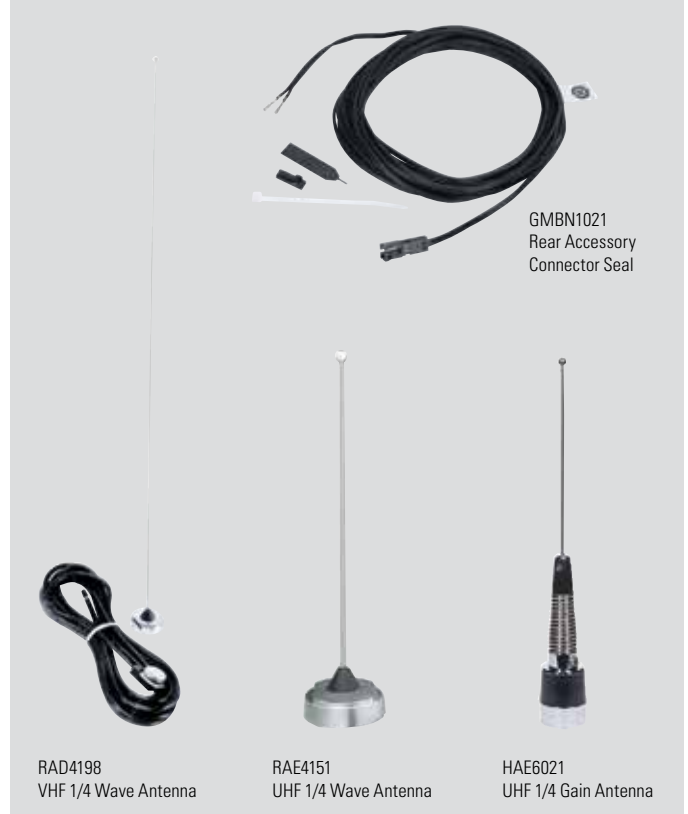
RAD4198 VHF 1/4 Wave Antenna