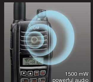
1500 mW powerful audio